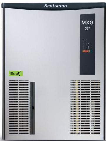
Medium gourmet cube 20g, 30mm dia x H 34mm