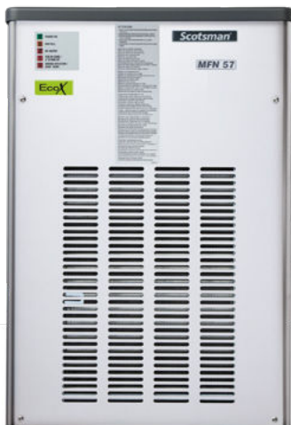
Nugget ice 1g – Ø 11mm x H 13mm