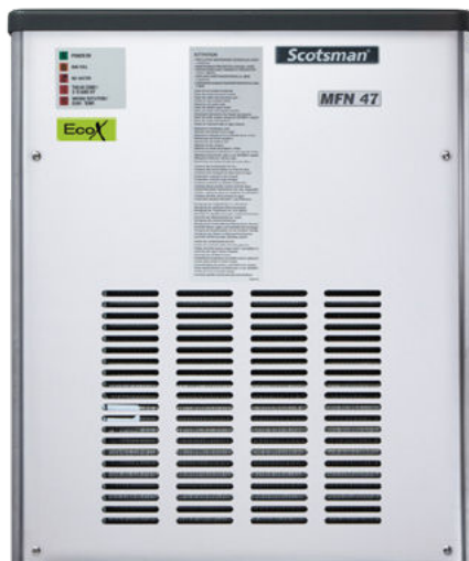
Nugget ice 1g – Ø11mm x H 13mm