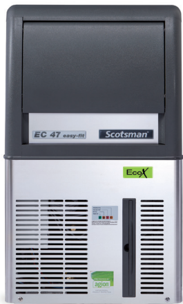
Medium gourmet cube 20g, 30mm dia x H 34mm

ECM 47 AS OX Medium gourmet cube 20g, Ø30mm x 34mm