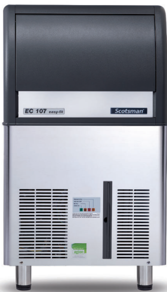
Medium gourmet cube 20g, 30mm dia x H 34mm