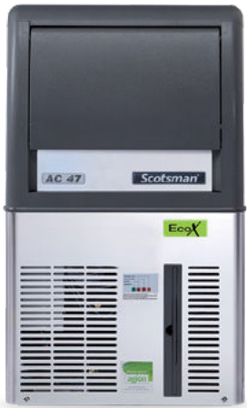
Medium gourmet cube 20g, 30mm dia x H 34mm

ACM 47 AS Medium gourmet cube 20g, Ø30mm x 34mm