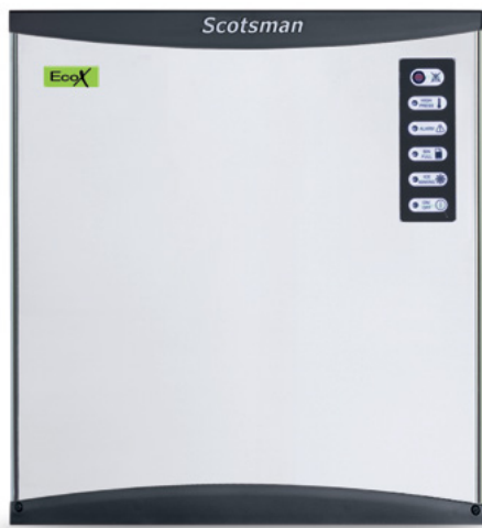
Large dice cube 15 g W 29 x D 22 x H 29 mm