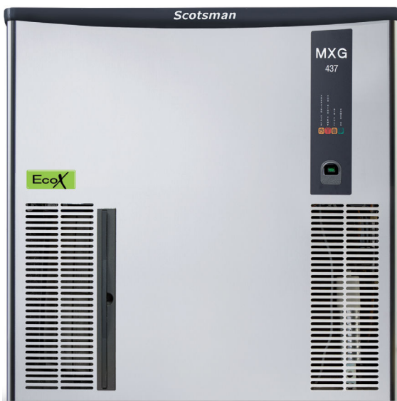
Large gourmet cube 39g, 38mm dia x H 41mm